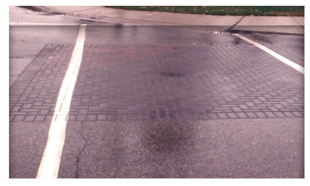
Figure 13. Concrete pavers in utility cuts can be painted as any other pavement.