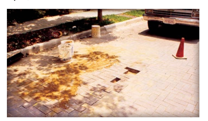
Figure 4. Reinstatement of the pavers, bedding and joint sand