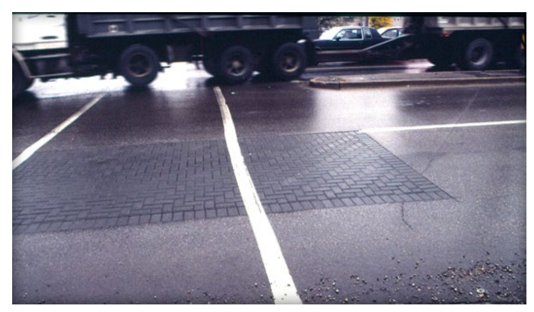
Figure 10. A patch of pavers in a heavily trafficked intersection in London, Ontario