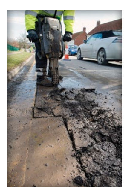
Figure 1. Repairs to utilities are a common sight in cities, incurring costs to cities and taxpayers.

Several studies have demonstrated a relationship between utility cuts and pavement damage. For example, streets in San Francisco, California, typically last 26 years prior to resurfacing. A study by the City of San Francisco Department of Public Works demonstrated that asphalt streets with three to nine utility cuts were expected to require resurfacing every 18 years (1). This represented a 30% reduction in service life