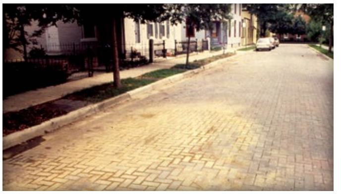
Figure 5. The final paver surface is continuous. There are no cuts or damage to the pavement.