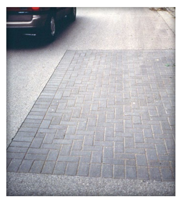
Figure 8. Utility cut repair in a residential area in London, Ontario.

require no curing. They can handle traffic immediately after reinstatement, reducing user delays. Furthermore, reinstated concrete pavers preserve the aesthetics of the street or sidewalk surface. There are no patches to detract from the character of the neighborhood, business district, or center city area. With many projects, concrete pavers help define the character of these areas. Character influences property values <u>and</u> taxes. Attractive paver streets and walks without ugly patches can positively affect this character.