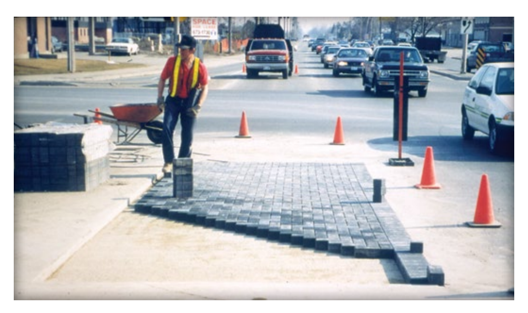
Figure 12. Pavers are laid in a 90 degree herringbone pattern between the border courses.

ers [nominally 4 in. by 8 in. (100 mm x 200 mm)] should be placed against the cut asphalt sides as a border course. They should be placed in a sailor course, i.e., the long side against the asphalt. No cut paver should be smaller than one third of a unit. Place pavers between the border course in a 90 degree herringbone pattern (Figure 12). Joints between pavers should be between <sup>1</sup>/16 and <sup>5</sup>/16 in. (2 to 5 mm). Compact the pavers with a minimum 5,000 lbf (22 kN) plate compactor. Make at least four passes with the plate compactor. A small test area of pavers may need to be compacted to check the amount of settlement. The bedding sand thickness should