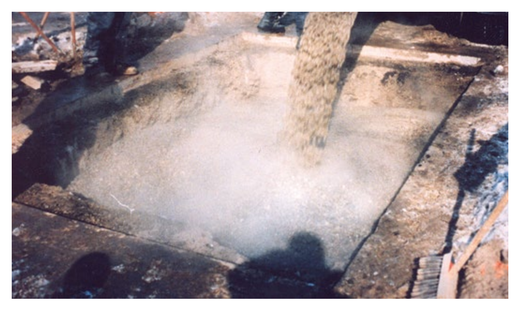
Figure 11. Low density concrete fill (unshrinkable fill) poured into a utility trench from a readymix concrete truck.

front end loader. Pieces along the saw cuts should be removed carefully to prevent damage to the edges.