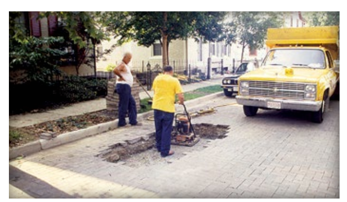
Figure 3. Compaction of the base