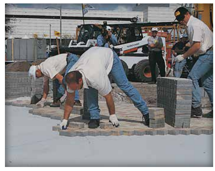
Figure 7. Placing the concrete pavers.

The finished surface of a compacted aggregate base should not allow bedding sand to migrate into it. If the surface will allow ingress of bedding sand, a choke course of fine material can be spread and compacted into the surface, or a bitumen tack coat can be applied. The surface of the base course and its perimeter around the edge restraints should be inspected for areas that might allow sand to migrate after installation. Such locations can be joints in curbs, around utility structures or