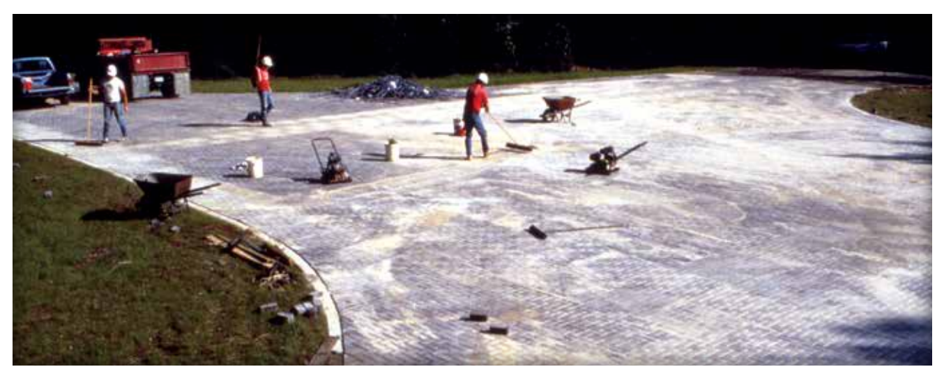
Figure 12. Excess sand swept from the finished surface will make the pavement ready for traffic.

Dry joint sand is swept into the joints and the pavers compacted again until the joints are full. See Figures 10 and 11. This may require two or three passes of the plate compactor. If the sand is wet, it should be spread to dry on the pavers before being swept and compacted into the joints. Joint sand may be finer than the bedding sand to facilitate filling of the joints. Bedding sand also can be used to fill the joints, but it may require extra effort in sweeping and compacting. Compaction should be within 6 ft (2 m) of an unrestrained edge or laying face. All pavers within 6 ft (2 m) of the laying face should have the joints filled and be compacted at the end of each day. Excess sand is then removed. See Figure 12. The remaining uncompacted edge can be covered with a waterproof covering if there is a threat of rain. This will prevent saturation of the bedding sand, minimizing removal and replacement of the bedding sand and pavers.