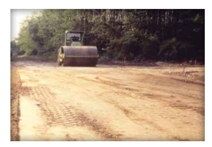
Figure 2. Compacting the soil subgrade.