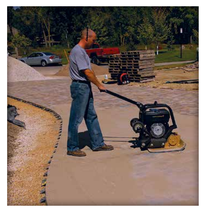
Figure 11. Vibrating sand into the joints.

performance. Certain manufacturers may have materials and data that discuss the potential benefits of shapes on functional and structural performance in vehicular applications. Chalk lines snapped on the bedding sand or string lines pulled across the surface of the pavers are used as a guide to maintain straight joint lines. Buildings, concrete collars, inlets, etc., are generally not straight and should not be used for establishing straight joint lines.