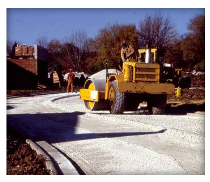
Figure 4. Base compaction with a vibratory roller.

When the fabric is placed in the excavated area, it should be turned up along the sides of the opening, covering the sides of the base layer. There should be no wrinkles on the bottom. When the aggregate is dumped on the fabric, the tires from trucks should be kept off the fabric to prevent wrinkling.