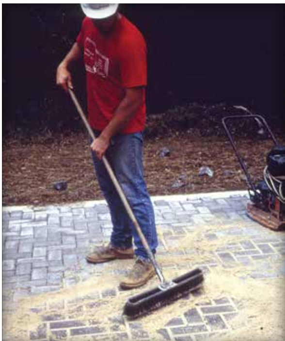
Figure 10. Spreading and sweeping joint sand.

Bedding sand under concrete pavers should conform to ASTM C33 or CSA A23.1. This material is often called concrete sand. Masonry sand for mortar should never be used for bedding, nor should limestone screenings or stone dust. The bedding sand should have symmetrical particles, generally sharp, washed, with no foreign material. Waste screenings and stone dust should not be used, as they often do not compact uniformly and can inhibit lateral drainage of moisture in the bedding layer. ICPI Tech Spec 17—Bedding Sand Selection for Interlock -