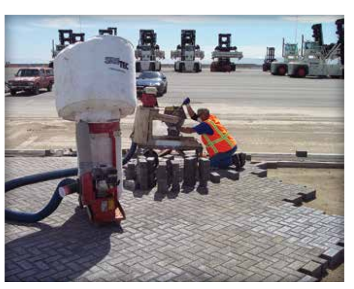
Figure 8. Saw cutting pavers.