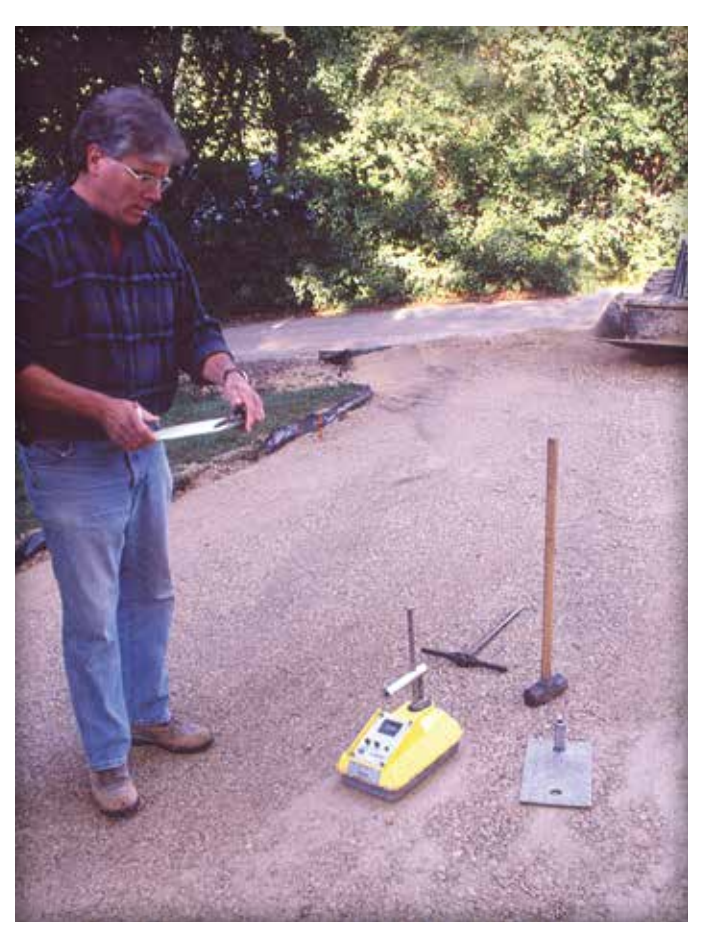
Figure 5. Density testing of the aggregate base with a nuclear density gauge.

Many localities determine base thickness with the 1993 Guide for the Design of Pavement Structures published by the American Association of State Highway and Transportation Officials (AASHTO). The AASHTO procedure calculates the structural number (SN) of the strength coefficients of each base and pavement layer. The SN is