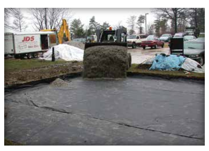
Figure 3. Application of the geotextile under aggregate base.