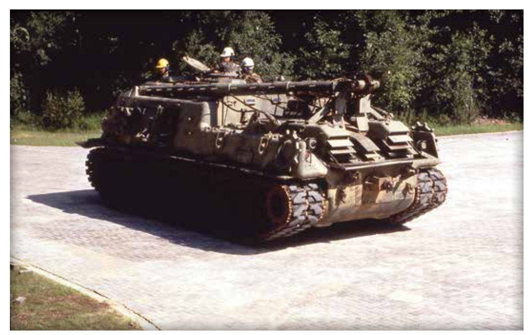
Figure 13. The completed paved area from Figure 12 receives tank traffic at the U.S. Army Proving Grounds in Aberdeen, Maryland.

Final surface elevations should not vary more than \pm^3/8 in. ( \pm 10 mm) under a 10 ft (3 m) straightedge, unless otherwise specified. Bond or joint lines should not vary \pm^1/2 in. (13 mm) over 50 ft (15 m) from taut string lines. The top of the pavers should be ^1/8 to ^3/8 in. (3 to 10 mm) above adjacent catch basins, utility covers, or drain channels, with the exception of areas required to meet ADA design guideline tolerances. The top of the installed pavers may be ^1/8 to ^1/4 in. (3 to 6 mm) above the final elevations to compensate for possible minor settling. A small amount of settling is typical of all flexible pavements. Optional sealers or joint sand stabilizers may be applied. Using stabilized sand may have advantages in areas prone to joint sand loss. See ICPI Tech Spec 5–Cleaning , Sealing and Joint Sand Stabilization of Interlocking Concrete Pavement for further guidance.