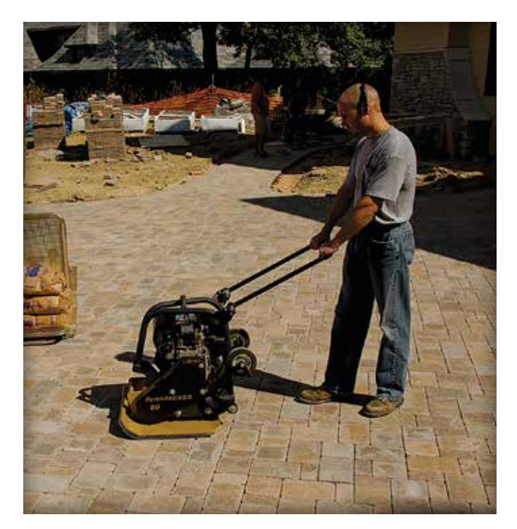
Figure 9. Compacting the pavers and bedding sand.

catch basins. These areas should be covered with a geotextile fabric to prevent loss of the bedding sand.