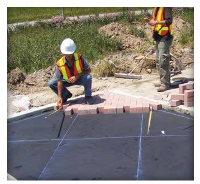
Figure 10. Cut pavers are added along the edges.

The hot bitumen-sand bedding layer is placed, screeded to about {}^{3}/{}^{4} in. (20 mm) thick and compacted while remaining above 250° F (120° C) (Figures 4 and 5). This layer typically compacts about {}^{1}/{}_{8} in. (3 mm). The depth of this layer must be consistent. If the area does not have a curb to support a screed, screed bars are placed directly on the concrete base to guide the screed. The bars are removed immediately after screeding and the narrow void spaces left from the removed bars are filled with additional, hot bitumen-sand mix and troweled smooth.