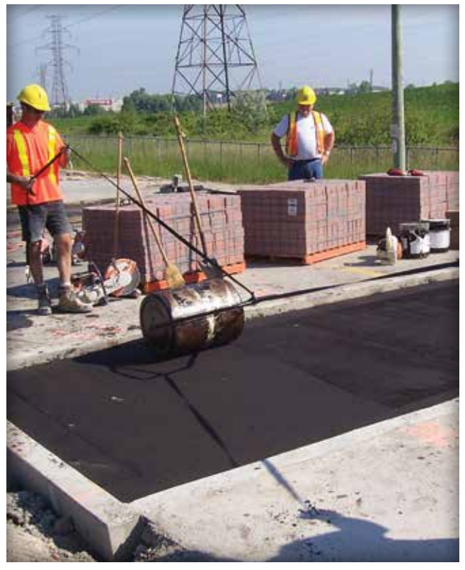
Figure 14. A water-filled roller compactor for compacting the bitumen-sand bedding.

practically impossible because the bitumen-sand material adheres to the bottom of the pavers when removed. It is less expensive to discard the pavers rather than remove the asphalt from the units and attempt to reinstate them.