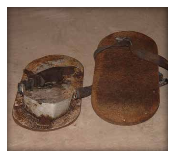
Figure 15. Walking on the hot bitumen-sand bedding with regular construction grade, steel-toed boots is discouraged. For limited walking on this layer, workers should wear boot sole covers shown here that resist damage and better distribute weight to prevent dentations.