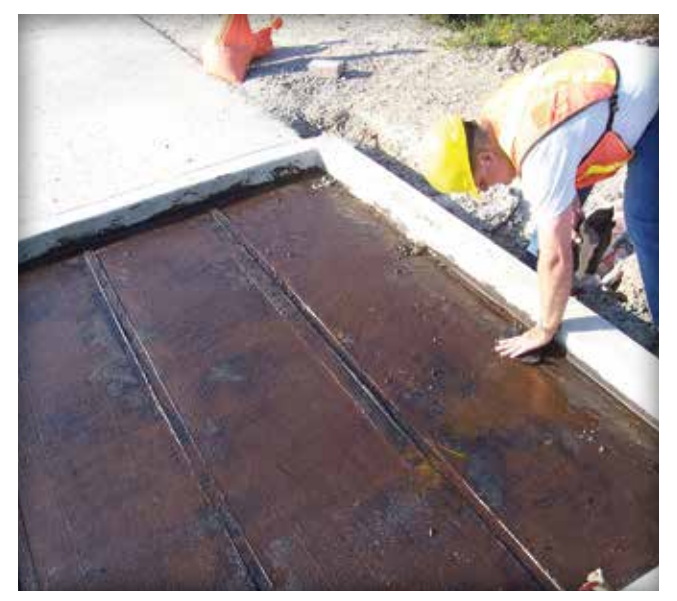
Figure 3. Confirming the tack coat has cured and is no longer wet to the touch.

Best application results are typically achieved using a synthetic paint roller with a short nap. Once applied the tack coat should not be disturbed and should be allowed to cure before covering with the setting bed material. As the asphalt emulsion cures it should turn from a brown to black color (Figure 3). This may take a few hours depending on weather conditions. When using SS-1 and SS-1h asphalt emulsions the temperature should be between 70 and 160° F (20 to 70° C) to allow for proper curing. Asphalt tack coats are recommended for vehicular applications. They are typically not required in pedestrian applications.