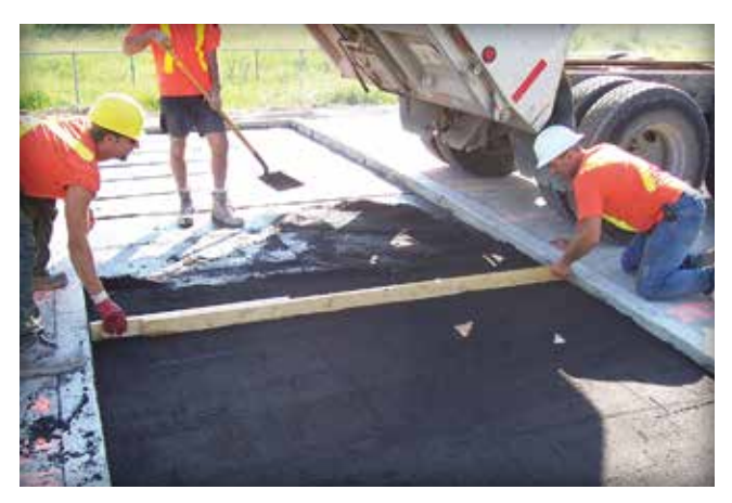
Figure 5. While the bitumen-sand is still hot, it is screeded to an uncompacted thickness of about <sup>3</sup>/<sub>4</sub> in. (20 mm).