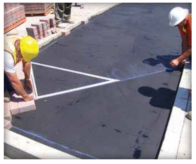
Figure 9. Perpendicular chalk lines are snapped and the pavers placed on the adhesive after the neoprene-asphalt adhesive dries (cloudy black surface).