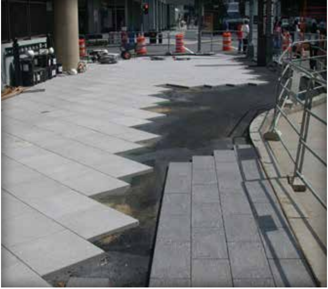
Figure 18. Paving slabs adhered to a bitumen-sand bedding in a Washington, DC, sidewalk.