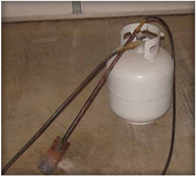
Figure 16. Occasionally, uneven bedding surface occurs and it is necessary to re-heat the bitumen-sand bedding with a propane heater tool.