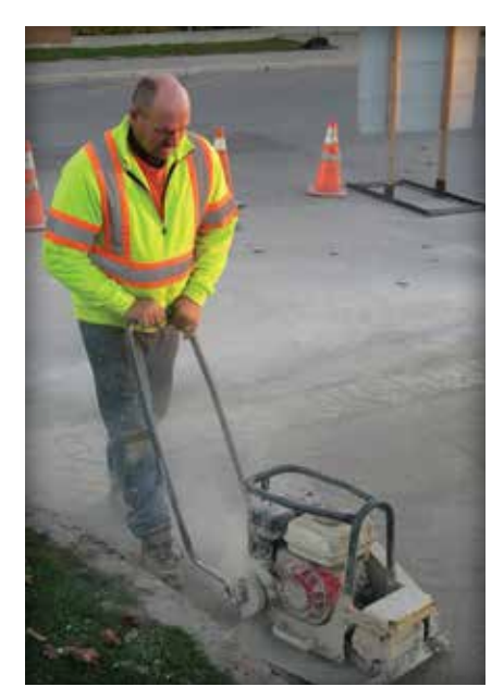
Figure 12. Once the pavers are in place, the joints are filled with dry joint sand and the surface is compacted.