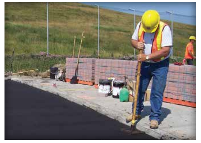
Figure 6. A hand tamper is used to compact in areas that cannot be reached with the roller compactor.