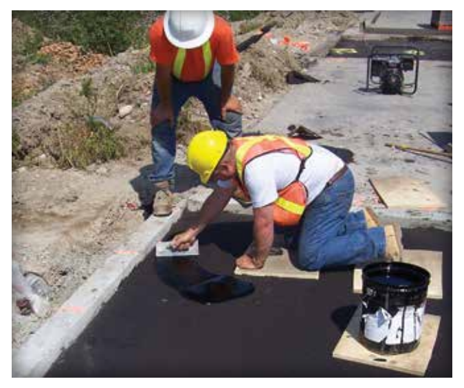
Figure 8. After the bitumen-sand mix cools, a 2% neopreneasphalt adhesive is applied. The material can be trowelapplied as shown here. Some materials are more viscous and can be spread with a squeegee.