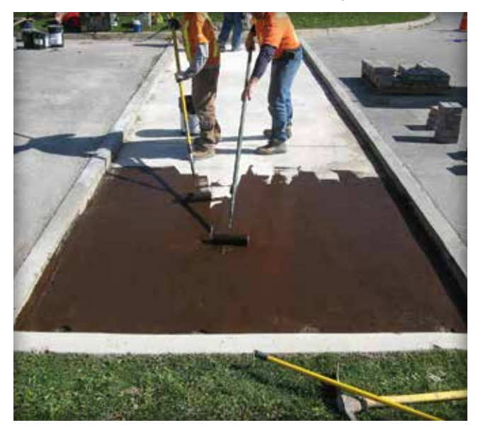
Figure 2. Emulsified asphalt tack coat is applied to a concrete base prior to applying the bitumen-sand mix.

Figures 2 through 12 demonstrate the bitumen-sand set interlocking concrete pavement installation sequence for a crosswalk. Once the concrete base is in place and cured