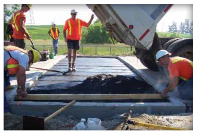
Figure 4. The hot bitumen-sand bedding material is dumped from a truck onto the concrete base.