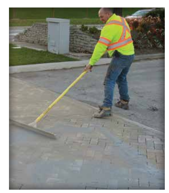
Figure 11. Sweeping in joint sand

The compacted bitumensand bedding layer can compensate for only very small surface variations in the concrete base and cannot be used to make up for a rough surface finish on the concrete. The bitumen-sand mix is placed, screeded and compacted in one small area at a time (typically a 100 to 300 sq. ft. or 10 to 30 m<sup>2</sup>) in order to screed and compact the mix while hot. Areas that can not be compacted with the roller compactor