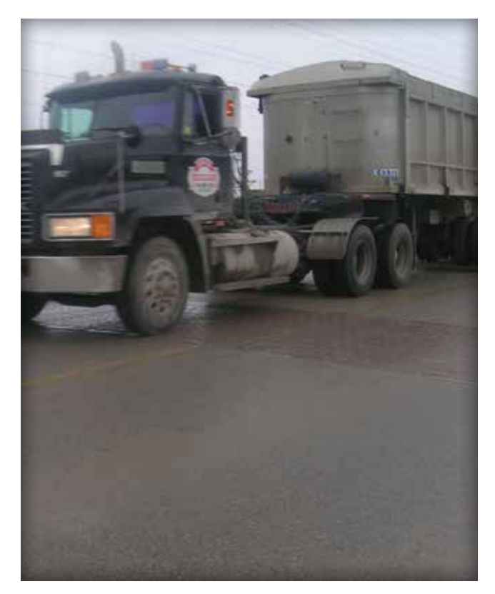
Figure 13. Crosswalk in use under heavy traffic.