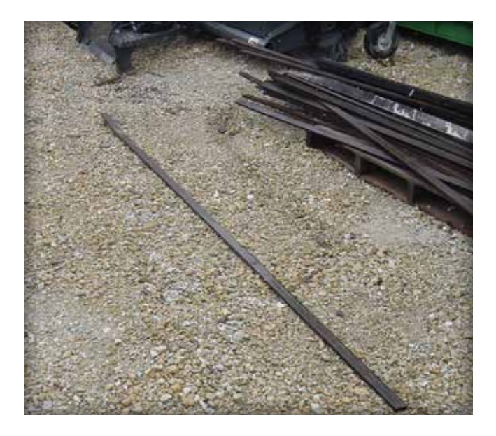
Figure 17. On larger projects, 1/2 in. (13 mm) thick steel screed bars are placed on the concrete base to ensure a uniform bitumen-sand bedding thickness.