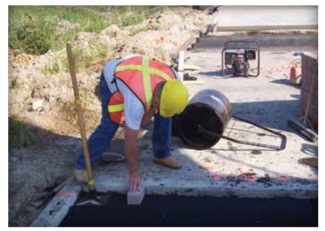
Figure 7. The compacted bedding elevation at the edge is checked with a paver.