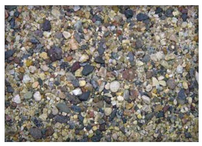
Figure 3. Example of sand from the ICPI bedding sand test program with a total combined percentage of sub-angular and sub-rounded particles equal to 65% according to ASTM D2488

Recommended Material Properties—Table 3 lists the primary and secondary material properties that should be considered when selecting bedding sands for vehicular applications. Bedding sands may exceed the gradation requirement for the maximum amount passing the No. 200 (0.075 mm) sieve as long as the sand meets degradation and permeability recommendations in Table 3. Micro-Deval degradation testing can be replaced with sodium sulfate or magnesium soundness testing as long as this test is accompanied by the other primary material property tests listed in Table 3. Other material properties listed, such as petrography and angularity testing are at the discretion of the specifier and may offer additional insight into bedding sand performance.