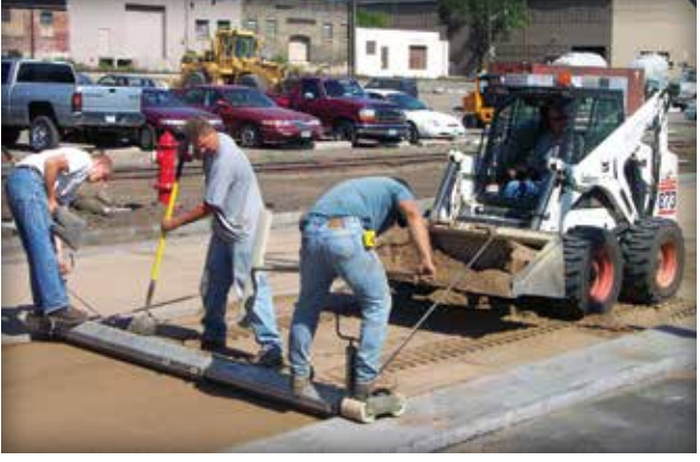
Figure 5. Mechanical screeding is the most efficient method of bedding sand installation

The sand should have sufficient moisture content to allow for adequate compaction. At no times should bedding sand be either "bone dry" or saturated. A moisture content range of 6% to 8% has been shown to be optimal for most sands (Beaty 1992). Contractors can assess moisture content by squeezing a handful of sand in their hand. Sand at optimal moisture content will hold together when the hand is re-opened without shedding excess water. Although it can be