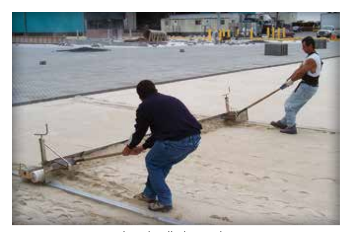
Figure 4. A two-man hand pulled screed

Role of Bedding Sand in Construction —Provided that the base was installed according to recommended construction practices and tolerances (See ICPI Tech Spec 2 — Construction of Interlocking Concrete Pavements ), the bedding sand ensures that the pavers have a uniform slope and meet surface tolerances without surface undulations or "waviness."