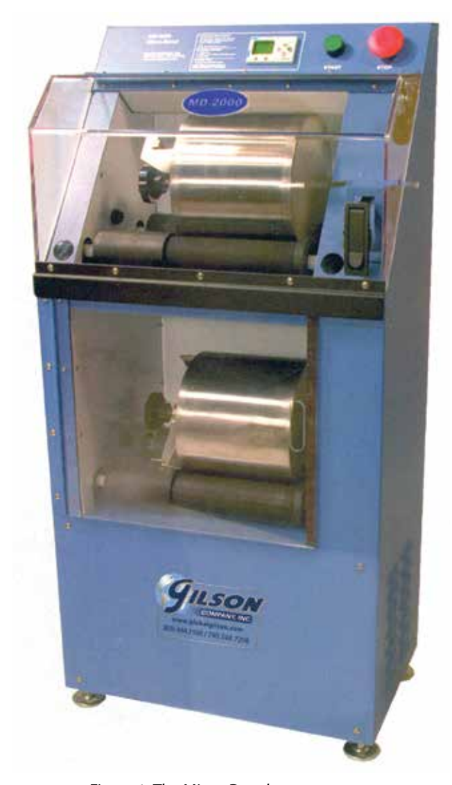
Figure 1. The Micro-Deval test apparatus.

Failure of the bedding sand layer occurs in channelized vehicular loads from two main actions; structural failure through degradation and saturation due to inadequate drainage. Since bedding sands are located high in the pavement structure, they are subjected to repeated applications of high stress from the passage of vehicles over the pavement (Beaty 1996). This repeated action, particularly from higher bus and truck axle loads, will degrade the bedding