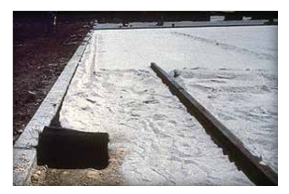
Figure 7. Woven geotextile used to contain bedding sand from migrating laterally. Visit www.icpi.org for detail drawings.

Interlocking concrete pavements should also be designed and constructed such that the bedding sand should not be able to migrate into the base, or laterally through the edge restraints. Dense-graded base aggregates with 5% to 12% fines (the amount passing the No. 200 or 0.075 mm sieve), will ensure that the bedding sand does not migrate down into the base surface. For pavements built over asphalt or con-